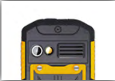
13 Megapixel Camera