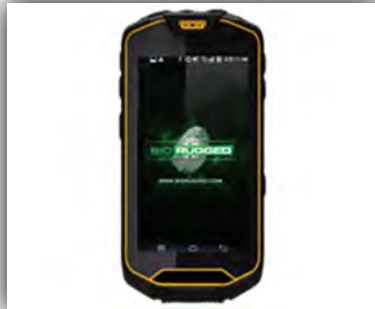
Wide Angle IPS Sun Readable Screen